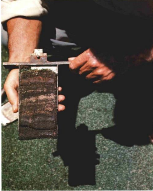
Several layers, created by topdressing with different materials, represent different management programs over the years.

away the soil with the point of a knife. Check for white, healthy roots and rhizomes. Use a Macroscope or a high-powered magnifying glass to observe the all-important root hairs. Another method is to soak the entire profile in a shallow pan of water and gradually wash away the soil until the roots are exposed. Record