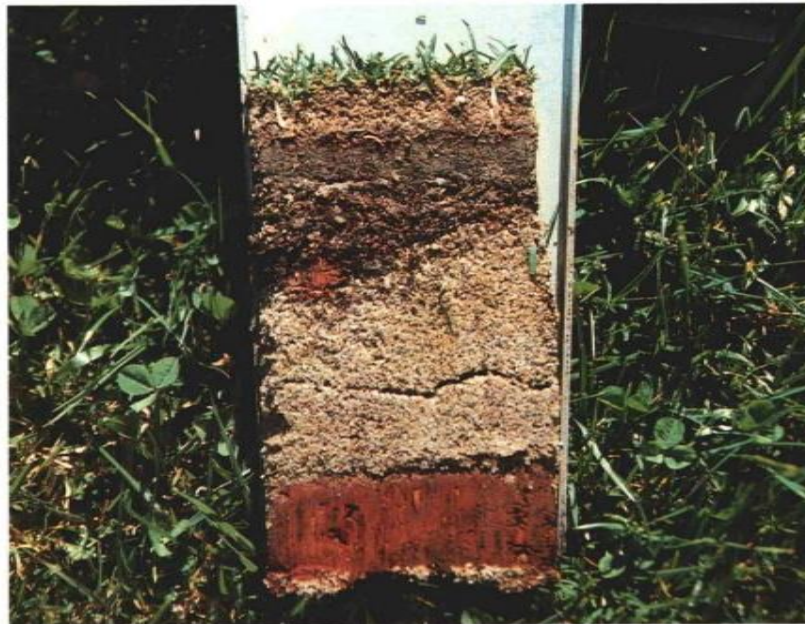
This profile indicates how poorly the soil was mixed during construction. Concentration of any one of the soil components creates problems in water movement and root development in the profile.

Soil Compaction, Bulk Density - Soil compaction or zones of high bulk density can be detected in an undisturbed soil profile. The zone or zones of compaction often can be found in a layer near the top of the profile, due to heavy traffic. They also may be found two or three inches down in the profile, due to the compression of hollow tine Aerifiers at the base of their penetration.