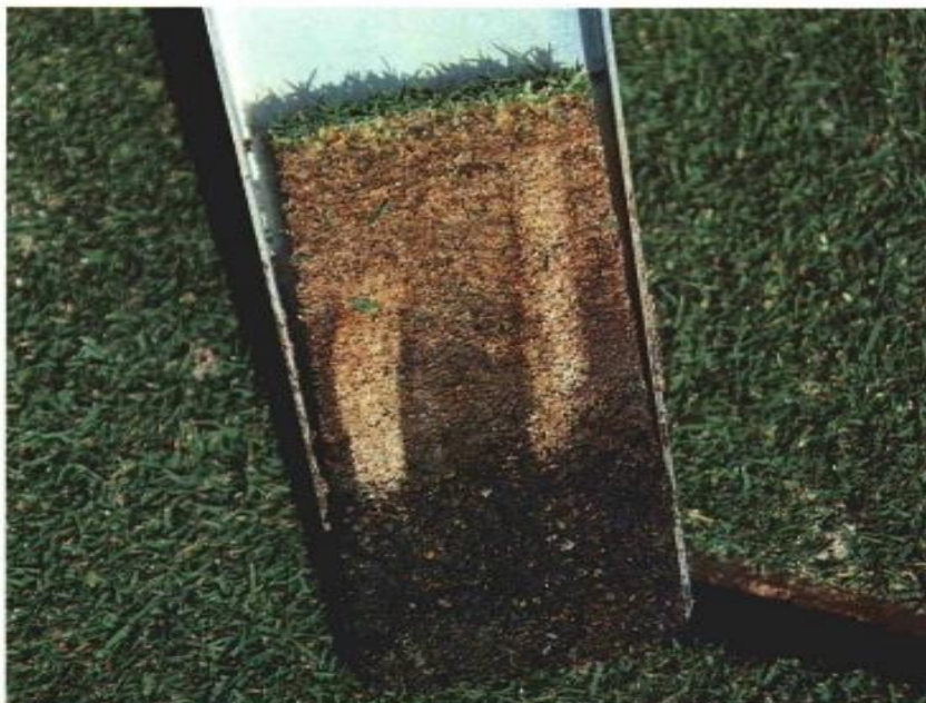
Soil drainage can be altered by manipulating the soil through hollow-tine aerification, and backfilling with a desirable topdressing mixture.

Roots - Root development can be observed by lifting